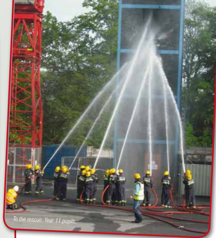
To the rescue: Year 11 pupils.

As a result, a total of £2,936 was raised by students and staff through sponsorship money, cake sales and fundraising parties.