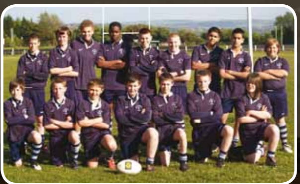
Unstoppable: The U13 rugby league team.